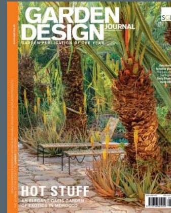
Inclusion in the Society's flagship magazine Garden Design Journal