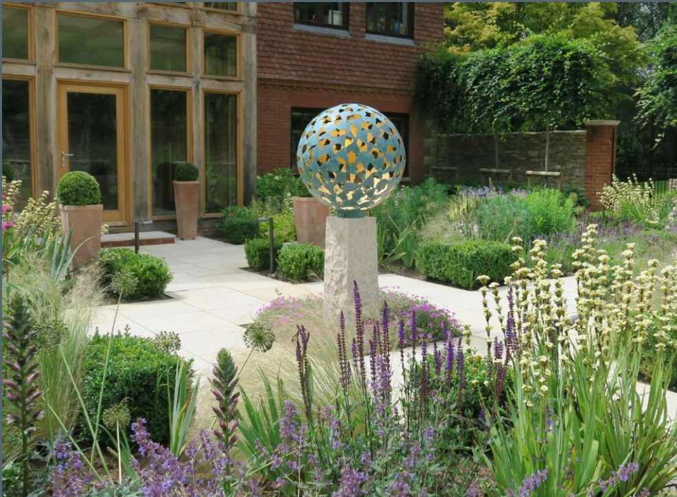
Private Residence

The Society of Garden Designers® (SGD) has been championing excellence in garden and landscape design for over 40 years.