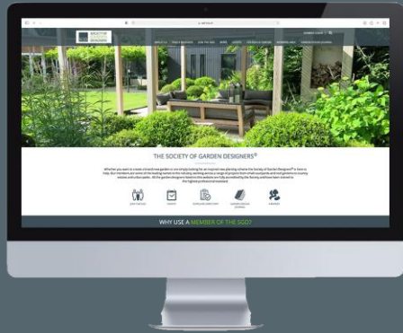
Branding on SGD Conference website, marketing, promotional material and e-newsletter