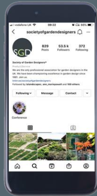
Connection through our social media network before, during and after the event