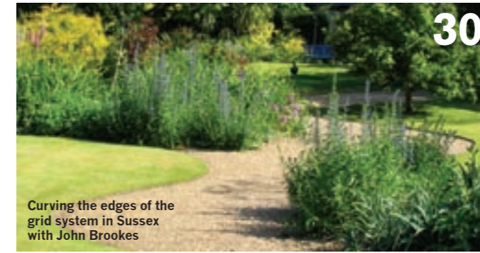
Curving the edges of the grid system in Sussex with John Brookes