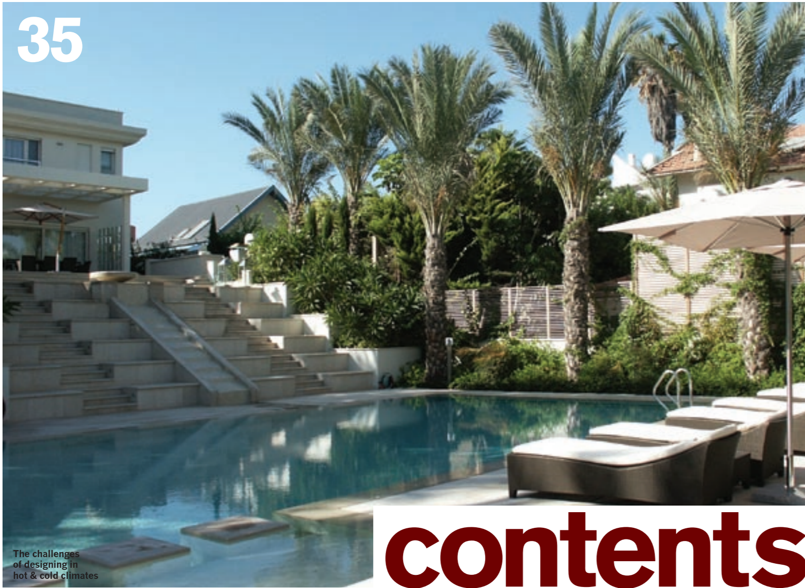
The challenges of designing in hot & cold climates