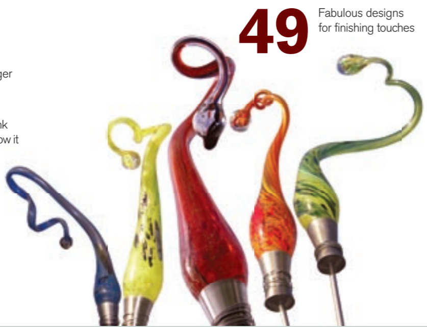
Fabulous designs for finishing touches