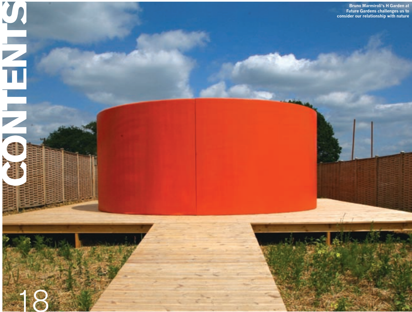
Bruno Marmiroli's H Garden at Future Gardens challenges us to consider our relationship with nature