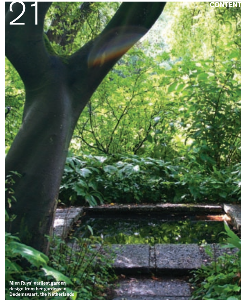
Mien Ruys' earliest garden design from her gardens in Dedemsvaart, the Netherlands

“It is possible to see connections between Ruys' work and that of other British designers; ideas appear to have flown back and forth across the North Sea”