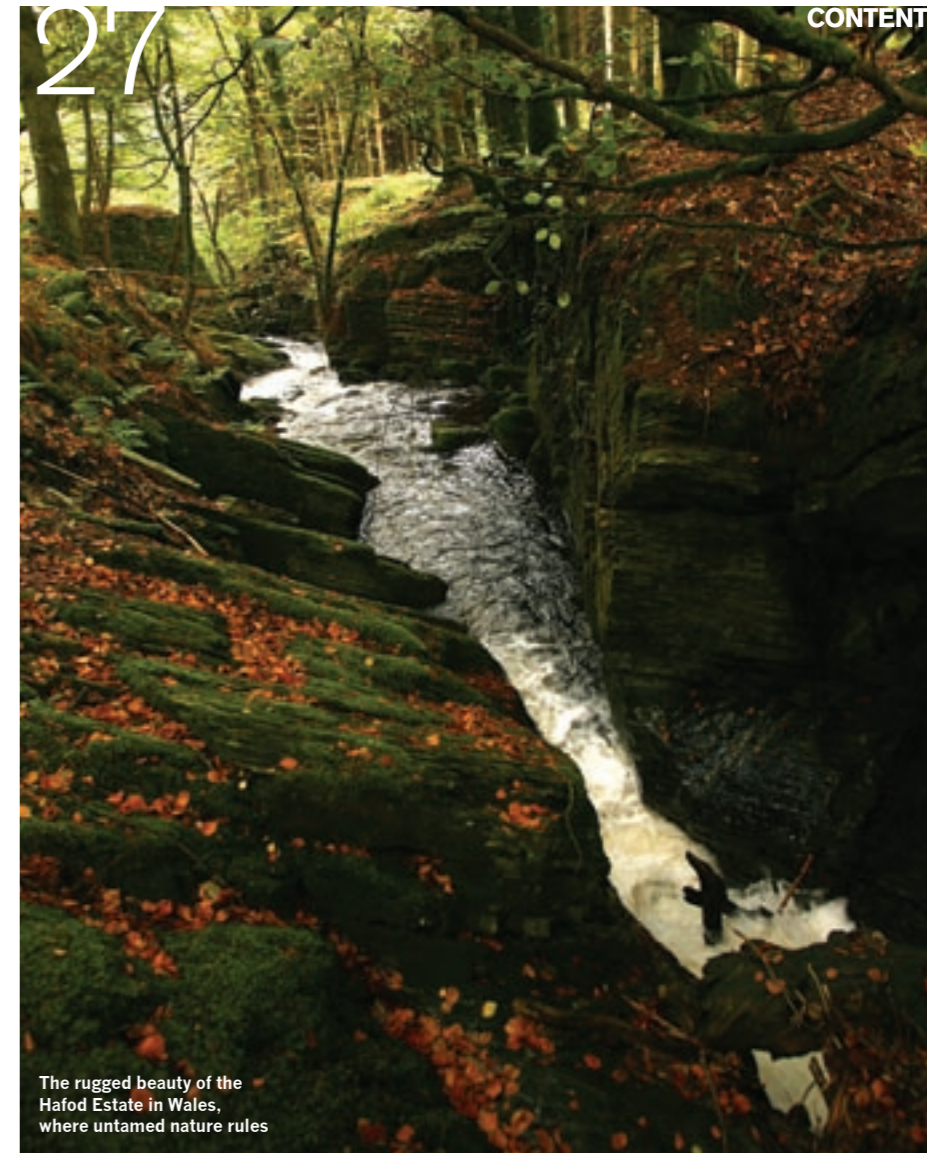
The rugged beauty of the Hafod Estate in Wales, where untamed nature rules

Member of the Association of Publishing Agencies